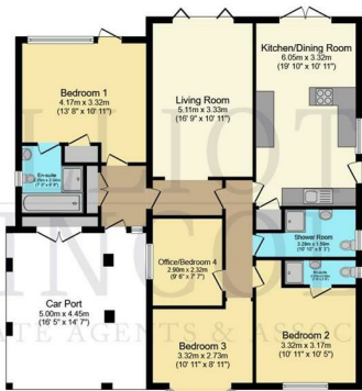
Floor Plan Floor area 108.0 sq.m. (1,163 sq.ft.)

The Pinford, 11 Trelawny Way, Bembridge, PO35 5YE